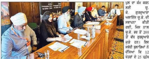
ਸਿੱਖ ਮਾਮਲਿਆਂ ਬਾਰੇ ਚਰਚਾ ਕਰਦੇ ਹੋਏ ਸੰਸਦ ਮੈਂਬਰ ਅਤੇ ਸਿੱਖ ਅਧੂ।