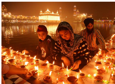
Sikhs celebrate the birthday of Guru Nanak in Amritsar, India on Friday.